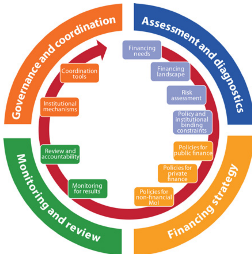
INFOGRAPHIC 1: THE INFFs BUILDING BLOCKS

In 2019, the IATF dedicated an entire chapter of its annual FSDR to INFFs with the aim of providing Member States with guidelines for the design and the implementation of these instruments. The chapter describes four building blocks for the operationalization of an INFF: i) assessment and diagnostics; ii) design of the financing strategy; iii) monitoring, review and accountability; iv) governance and coordination. The guidance materials for each building block and updated resources can be found on a dedicated website 13 . As reminded in the 2019 FSDR, “ The integrated financing framework will not need to reinvent the wheel ” 14 , in most cases, these instruments will build on already existing financing policies and institutional arrangements, increasing their effectiveness, coherence and alignment with sustainable development.